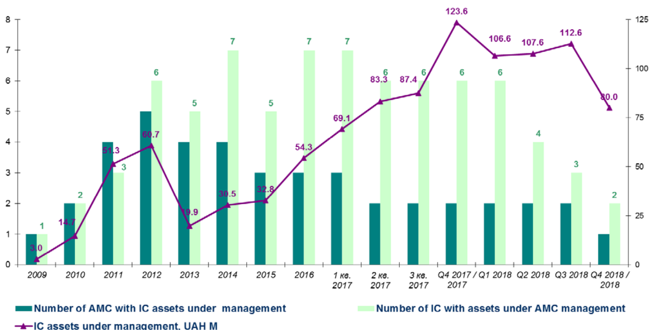
Chart 1. Dynamics of IC asset management in 2009-2018 and in Q1-Q4 2018

Assets of IC under management for the 4th quarter of 2018 decreased by 28.9%, and for the year 2018 - by 35.2% (after +127.5% in 2017). As at 31.12.2018, these assets amounted to UAH 80.0 M. (Table 1).